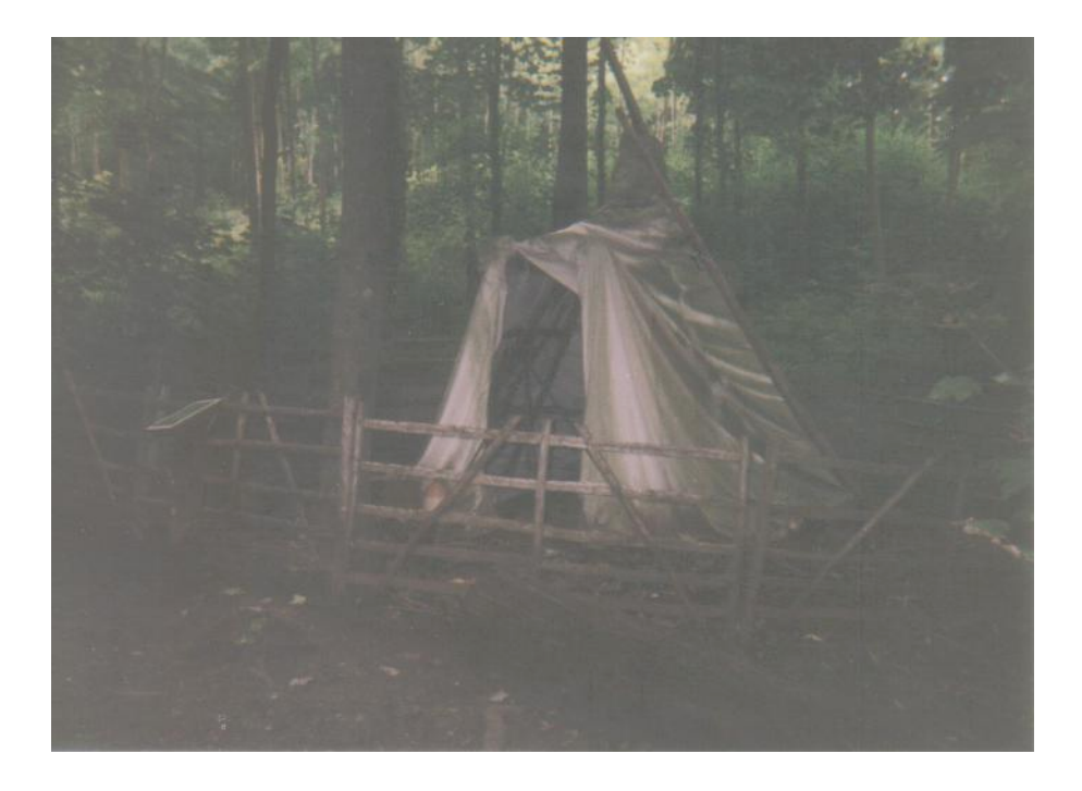
As seen occasionally during series 5 (again, minus the fence), this is a working charcoal oven: